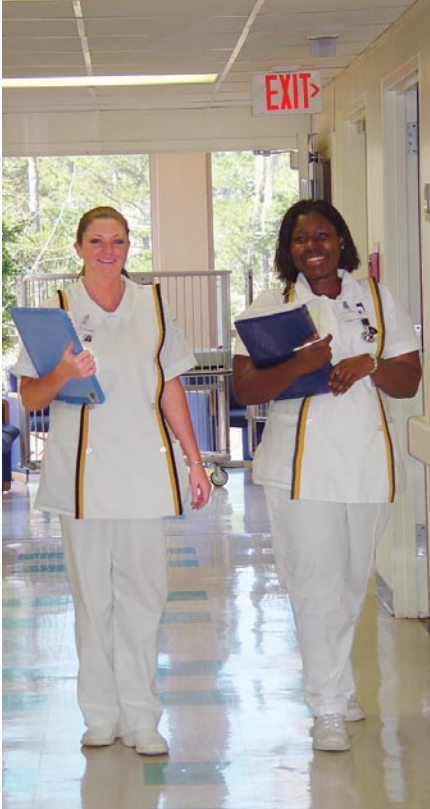
SWGTC students complete internships at area hospitals.