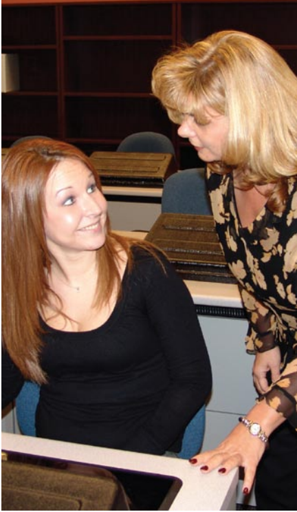
SWGTC staff members support student success.