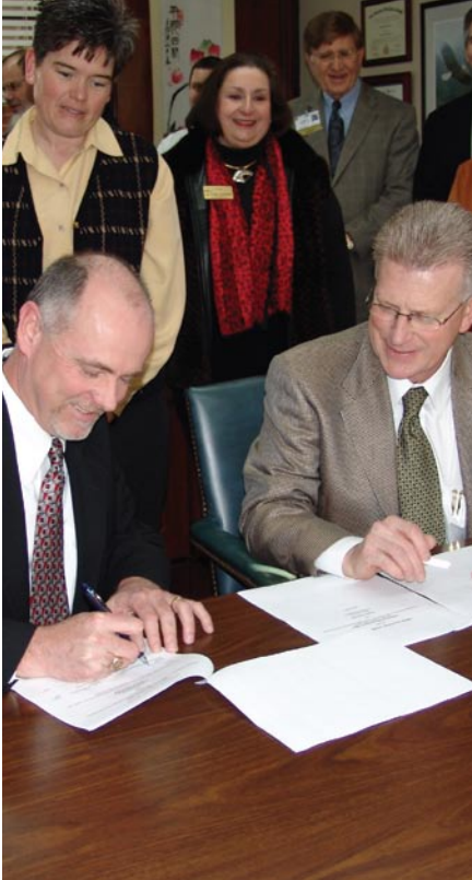
SWGTC and Thomas University Presidents sign articulation agreement.

Our College and our community working as a team.