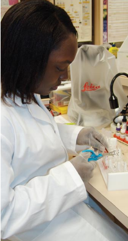
SWGTC students train on state-of-the-art equipment.