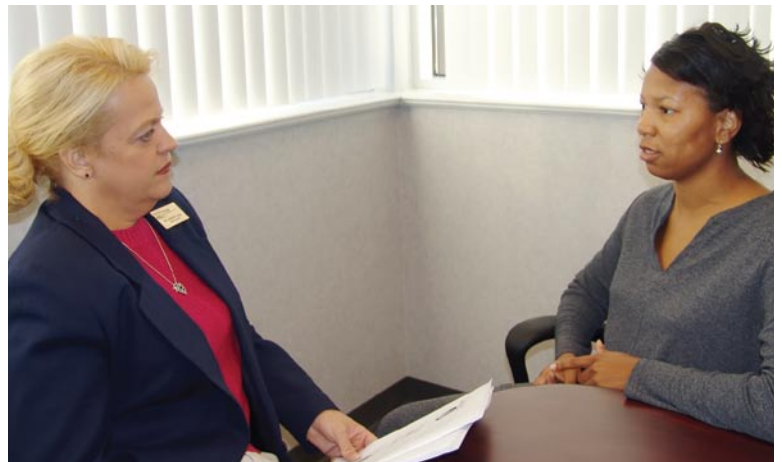
SWGTC students benefit from career counseling advisement services.